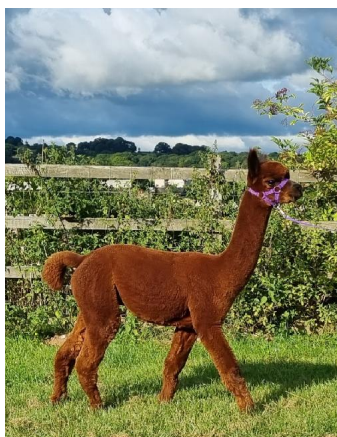
Patou Magnum August 2023