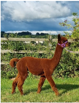
Patou Magnum August 2023