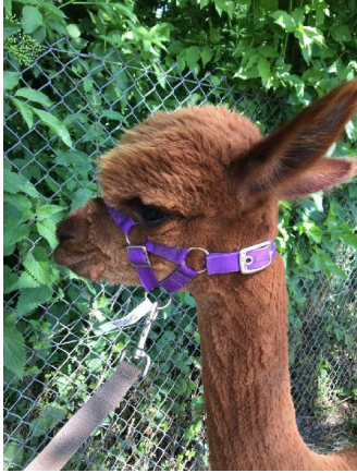
Hensting Honeysuckle body