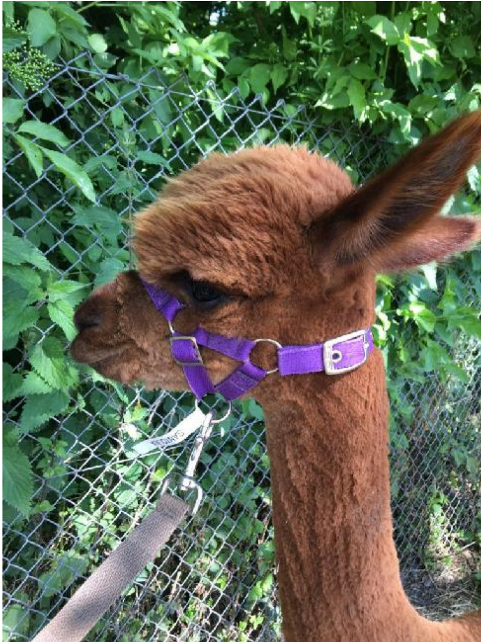
Hensting Honeysuckle Head

In summary, Hensting Honeysuckle, with her captivating Dark Thorn coat, halter training, soft fleece, and impeccable pedigree, embodies both beauty and functionality. Whether you are a discerning alpaca enthusiast or a breeder seeking to enhance your herd's genetic diversity, Hensting Honeysuckle is a treasure that is not to be overlooked. Embrace the opportunity to welcome her into your world and let her grace and magnificence elevate your alpaca journey to new heights.