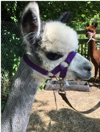
Hensting Santolina Body