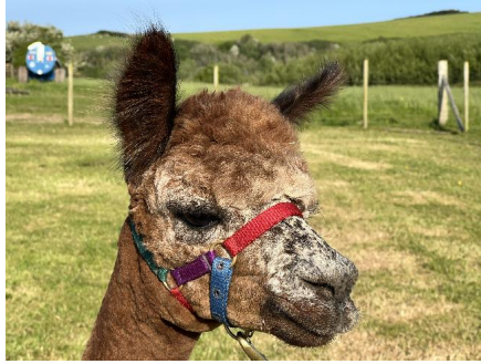
Mullacott Wren (left side)