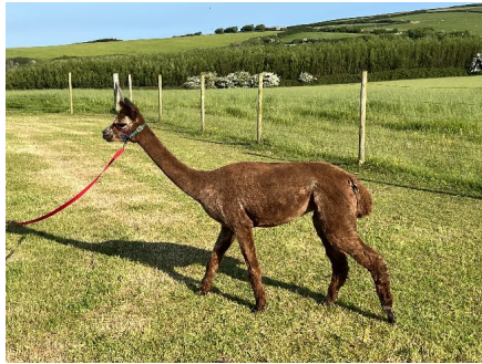
Mullacott Wren (right side)