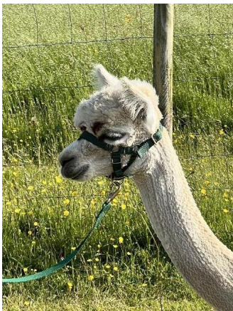
Mullacott Zola (side)