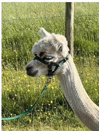
Mullacott Zola (side)