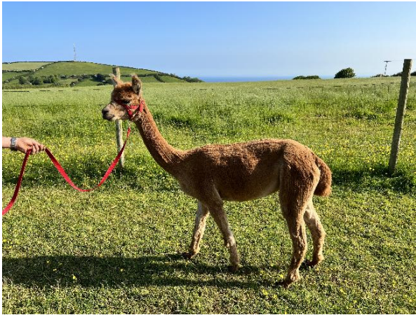
Mullacott Melody (side 2)