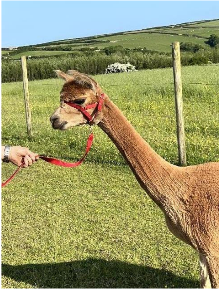
Mullacott Melody (side 1)