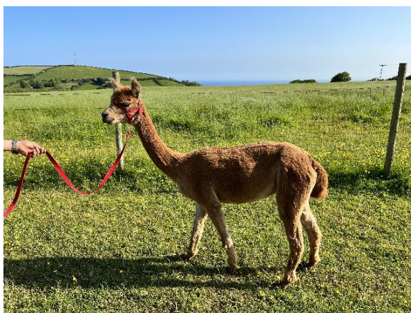
Mullacott Melody (side 2)