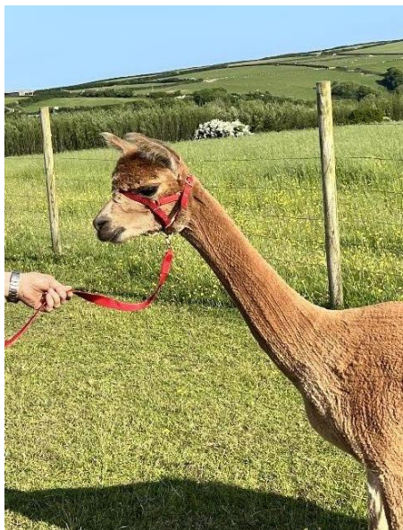
Mullacott Melody (side 1)