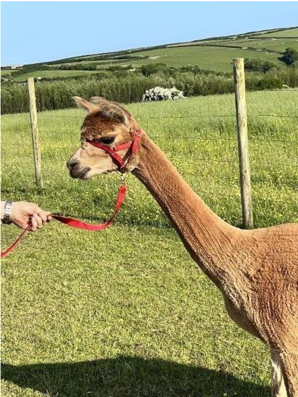
Mullacott Melody (head)