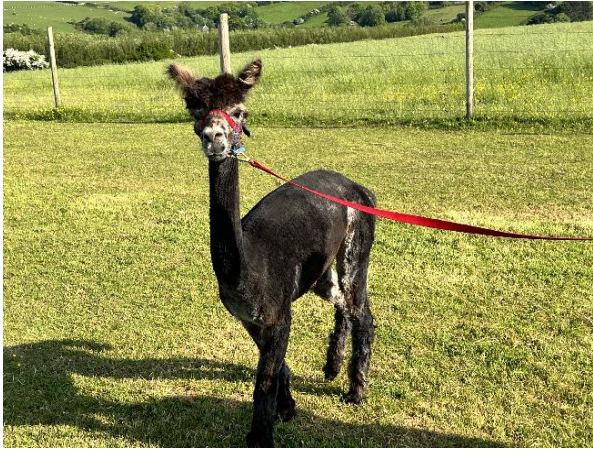
Mullacott Celeste (face)