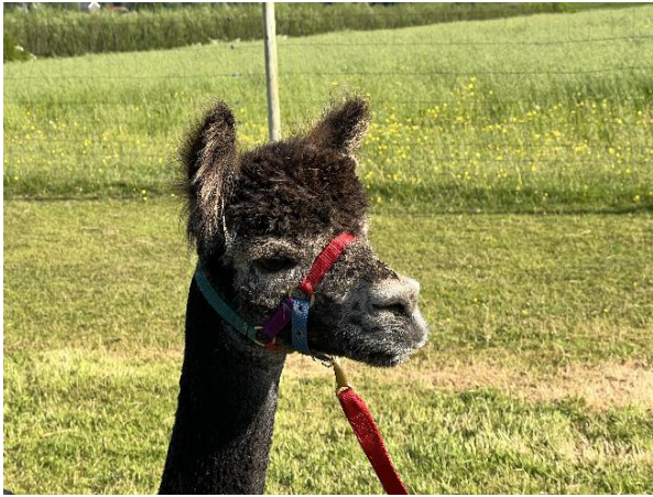
Mullacott Celeste (side)