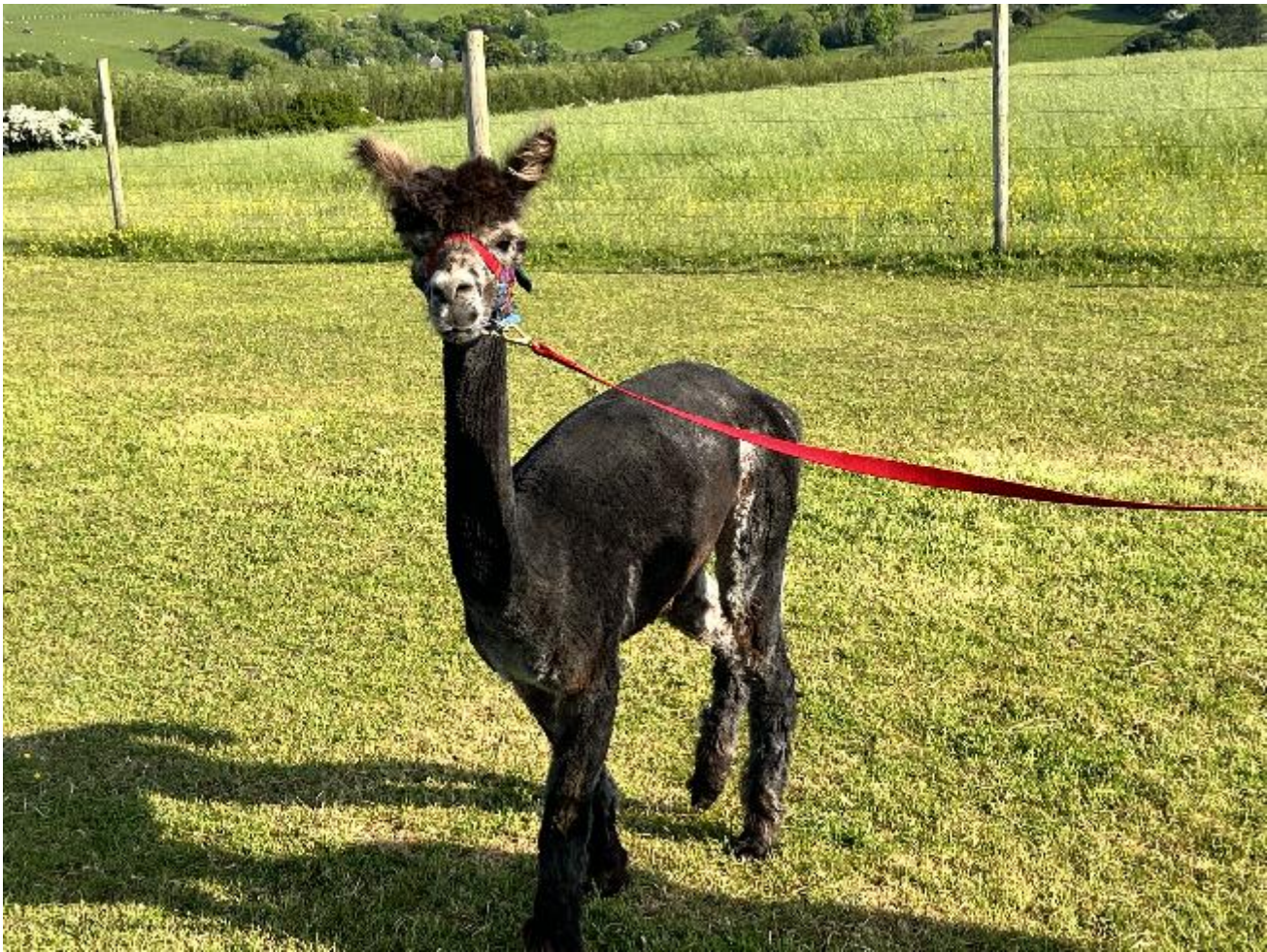
Mullacott Celeste (front)