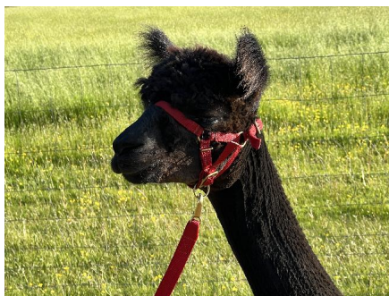
Mullacott Lucinda (side)