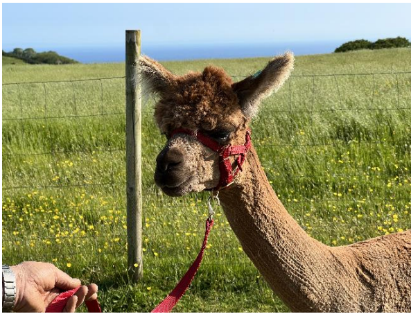
Mullacott Freda side