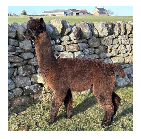
Champion of Champions Black Fleece 2022