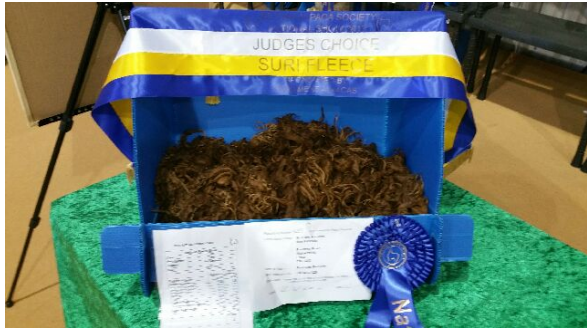
Champion Brown 2018 at Three Counties Fleece