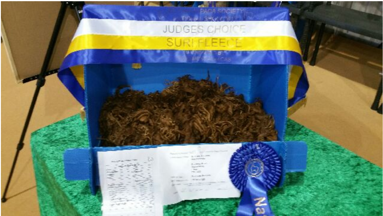
Champion Brown 2018 at Three Counties Fleece