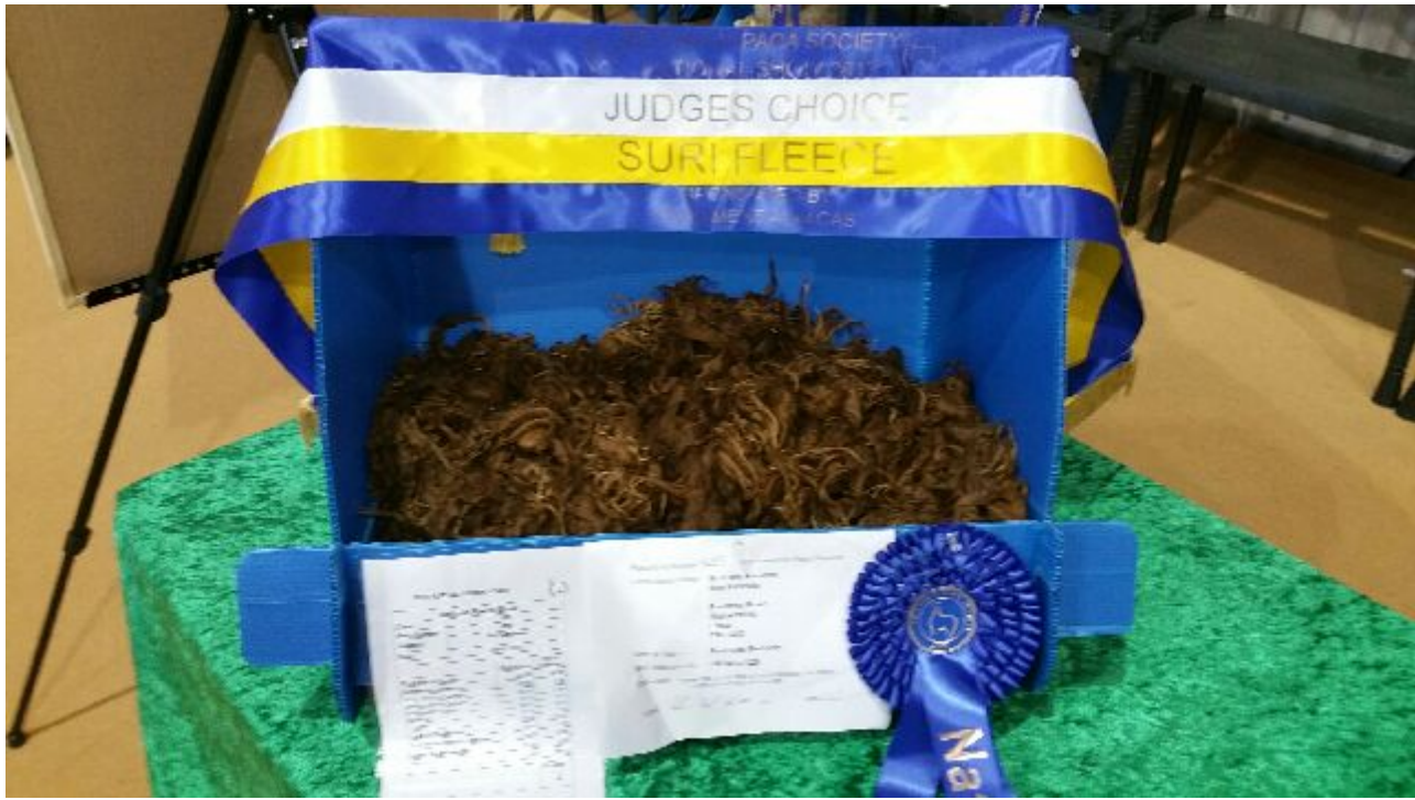
Champion Brown 2018 at Three Counties Fleece