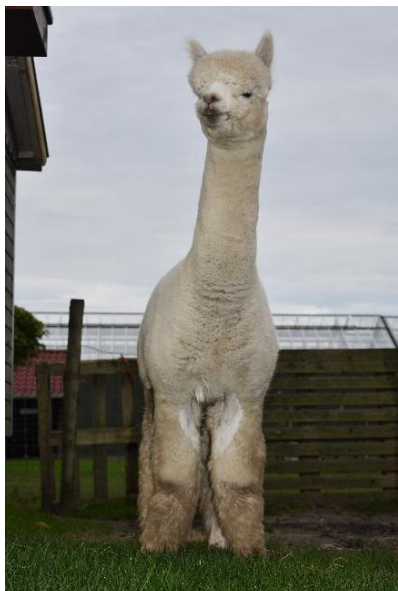
Fleece FAL Peruvian Jack of Diamonds