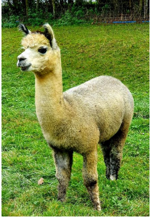
Rapahel Fleece January 2022