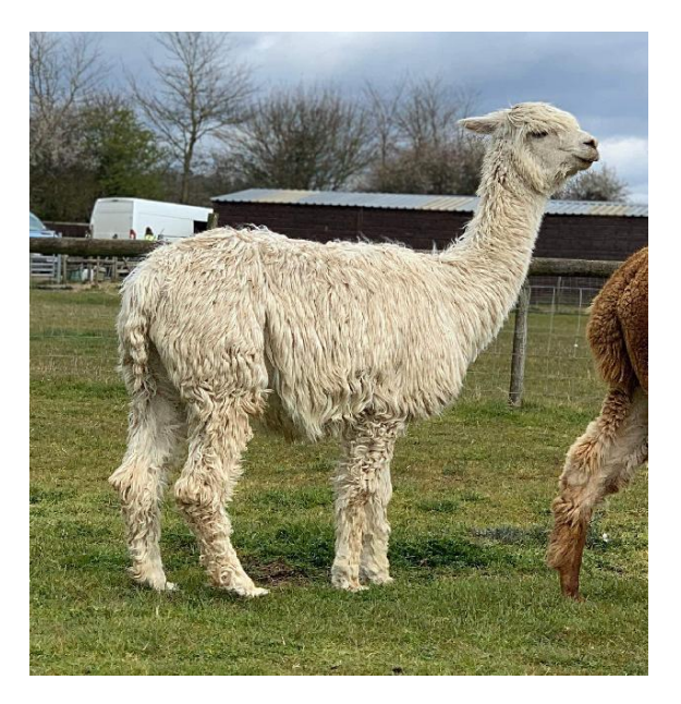
Houghton Tall Polly