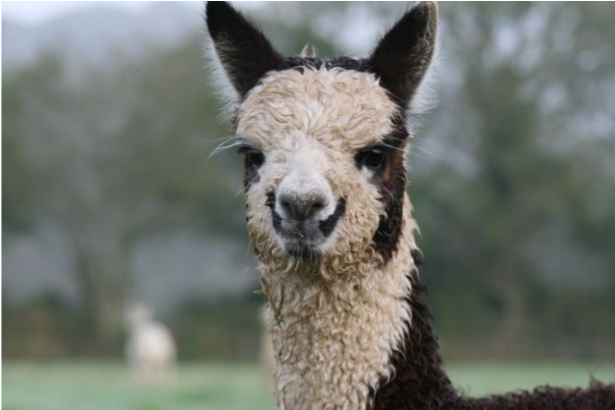
Kestle Trelawney 1

At three months old, this was inspired by Trelawney: "With a moustache that reminds of Picasso's, this Cornish boy is a piece of art. I can't figure out his shade yet. The changing stormy lights of Cornwall and his cria fleece make it difficult to decide precisely. The patterns, nearly identical to his sister's Kestle Harley Queen, make a perfect locking puzzle. He calls his mum with the sweetest humming voice and jumps and crashes on his playmates' chest like a grown warrior. Touch, and you can't feel him. Look closely and be amazed by his lustre, darker beneath than his surface shows. Long legs and strong stand, deceiving age of this big Kestle Trelawney, just under three months old."