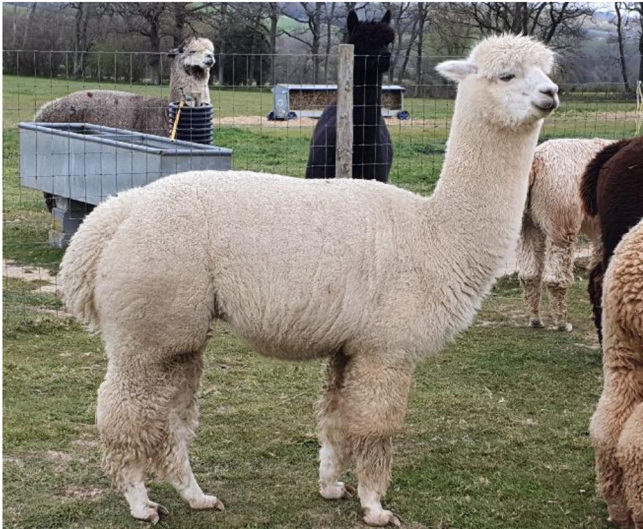
Delta first fleece