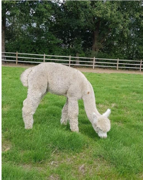
Alpaca Photo 2