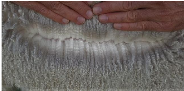
Alpaca Photo 3