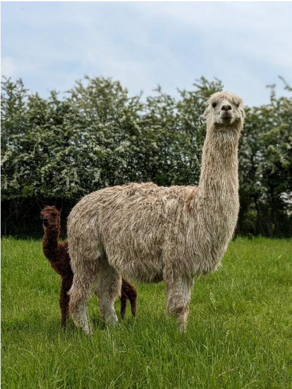
Spring Flower with Orientree's Saturn, her cria at foot