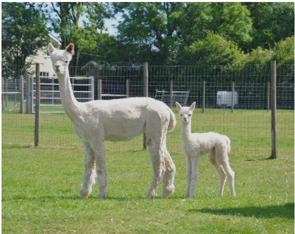
Blousy and cria