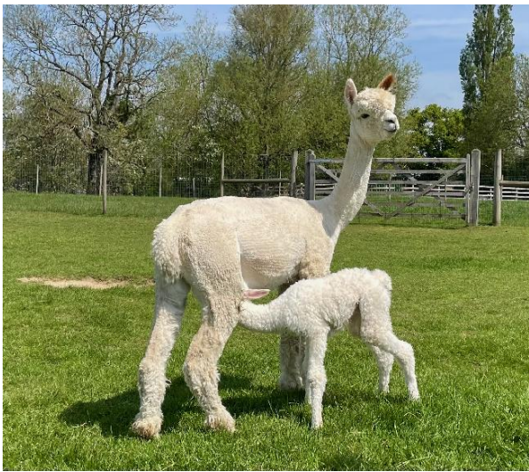
Blousy close up