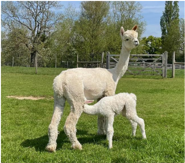
Blousy close up