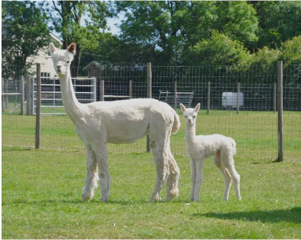
Blousy and cria