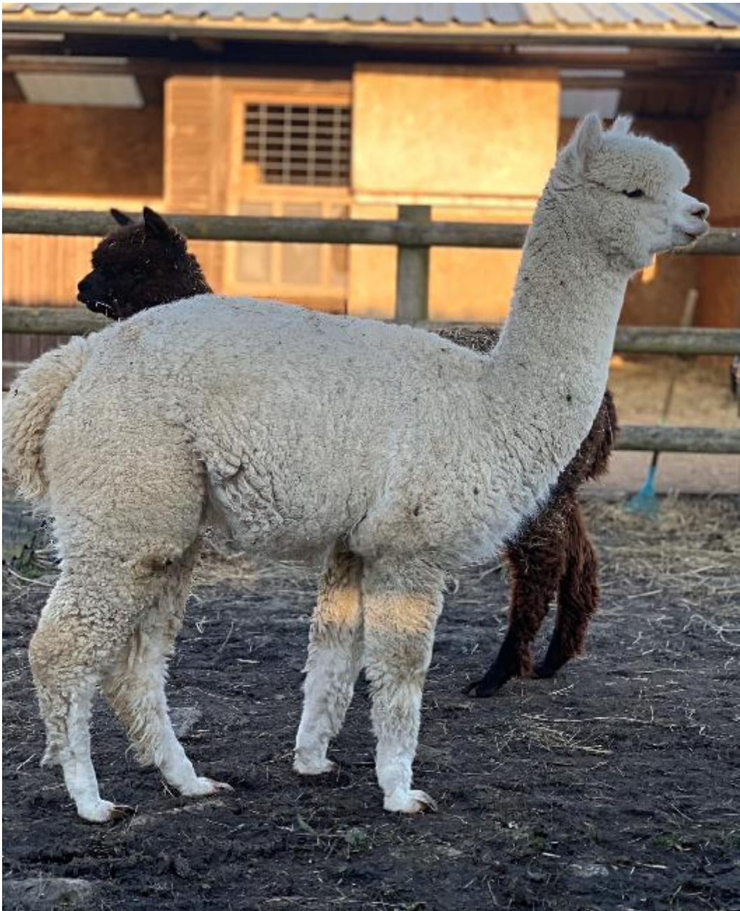
Lane House Flirtation