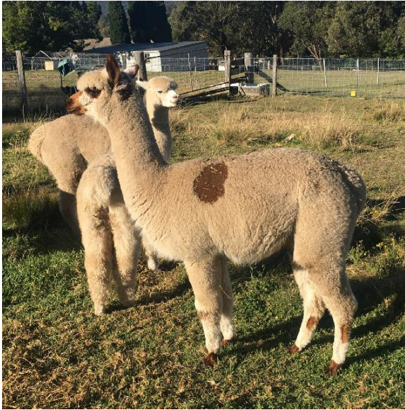
Dotti's fleece Aug 2019