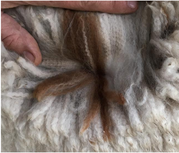
Dotti Fleece Stats 2019