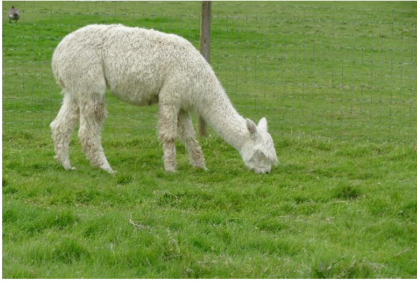
Amalie May 2