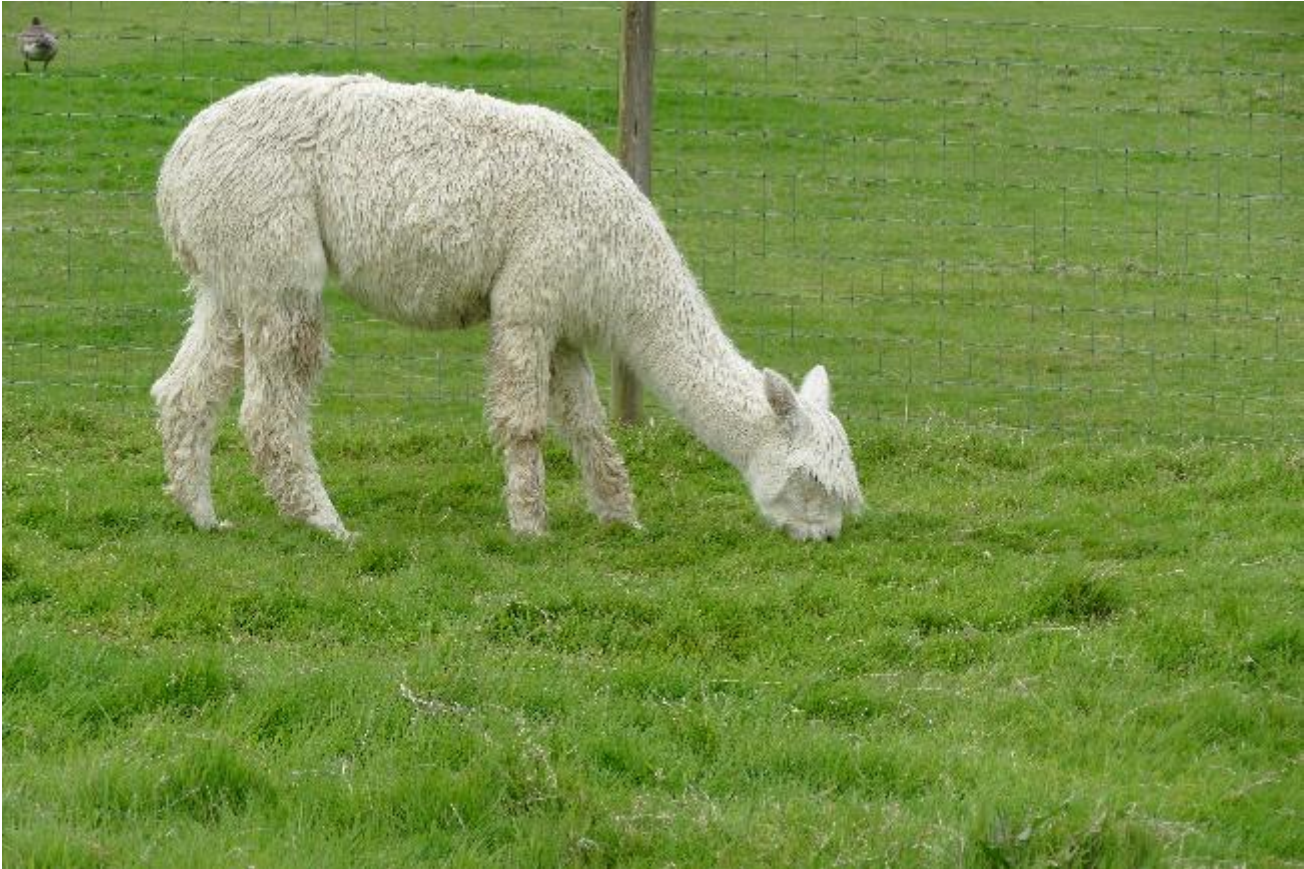
Amalie May 2