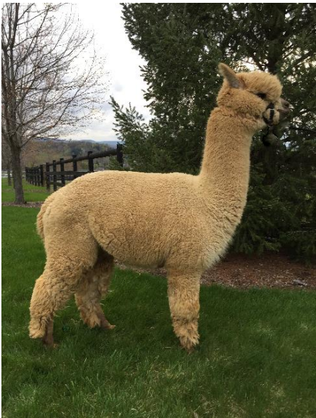
Alpaca Photo 2