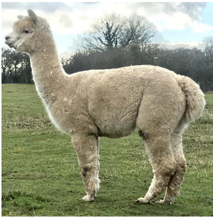
2018 fibre results