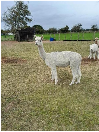
Alpaca Photo 2