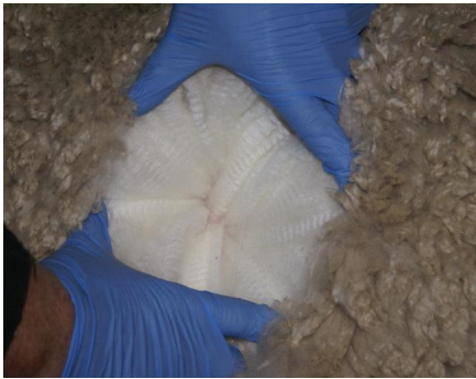
Beck Brow Explorer's Cria Fleece at 5 months of age