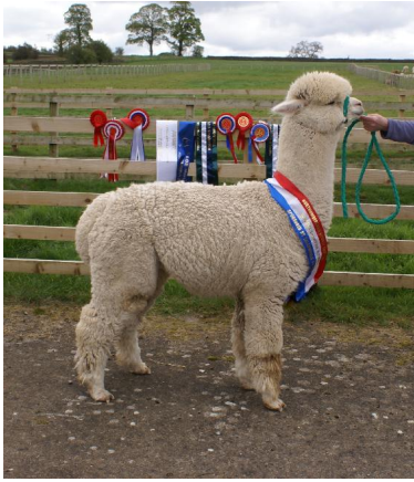
Fleece shot April 2012